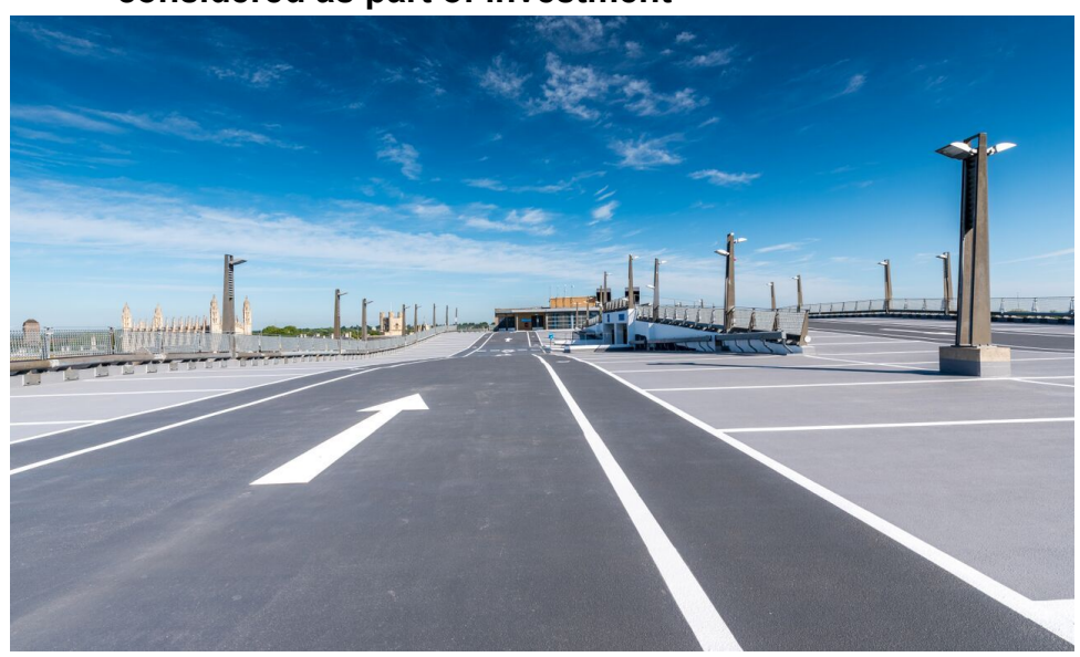
Appendix 1 Images showing types of improvements that will be considered as part of investment